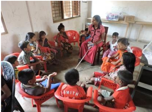
NPCODA involved in Disability Inclusive awareness raising.