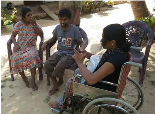
DPO members collecting data