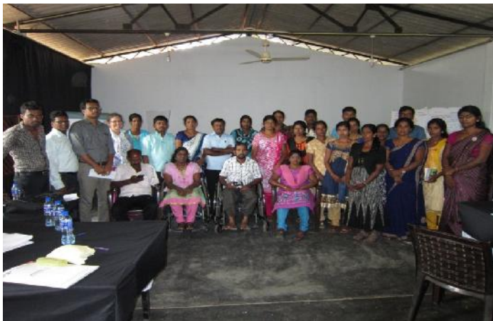
Photo: Training participants on CRPD