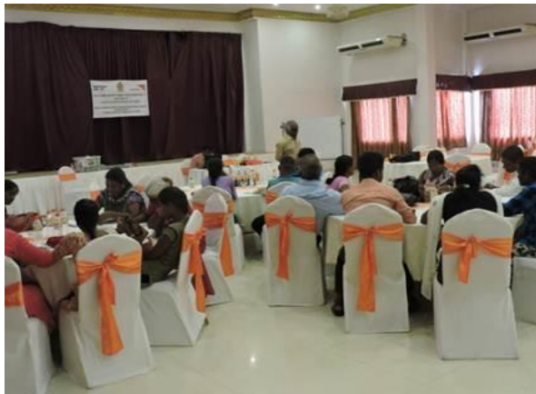
Key Findings discussion of disability studies with change agents