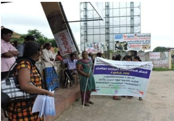
DPO members in District project steering committees