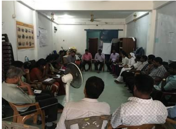
NPCODA leads disability forum meeting in North