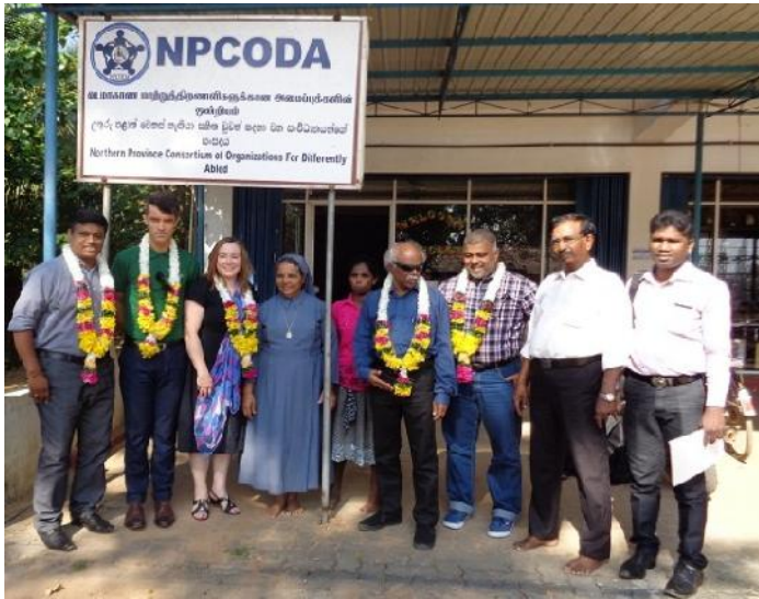
Signing MoU with NPCODA