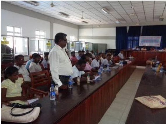
DPO members in District project steering committees