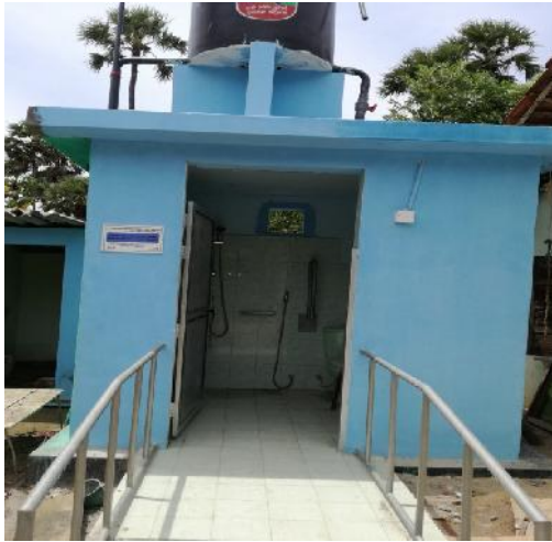
Household toilet with universal access